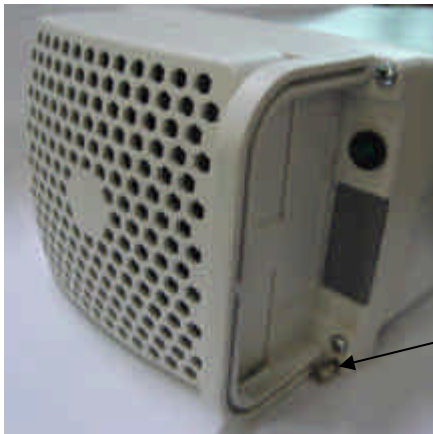
Figure 1: Close up of Right Side Mounting Screw

Front mounting screws: TDI has a continuous improvement plan in place for the Mercury product line. This notification outlines planned changes to the front mounting screws. A Global change on the Mercury module range is being made based on Customer input that the slotted fixing hardware could be improved by changing to Phillips style heads. We will be changing the slotted-head type mounting screw to a Phillips-head screw shortly. The new fixing screw will also have a “lead-in” point. We expect that at current stock and run-rates, this could take as long as 4-months before actual production units are delivered with the new hardware.